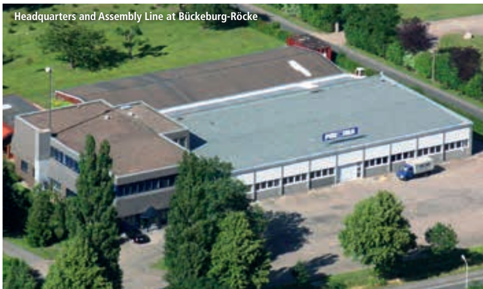
Headquarters and Assembly Line at Bückeberg-Röcke