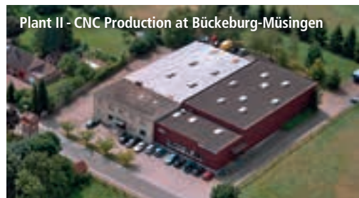
Plant II - CNC Production at Bückeberg-Müdingen