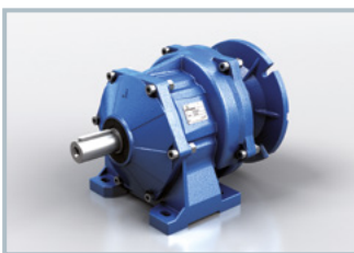
HA Fitted for motor coupling