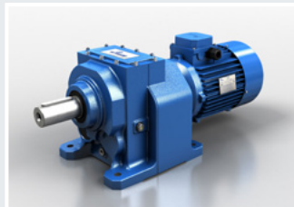
CH With compact motor