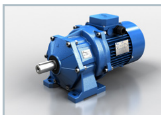
CHA With compact motor