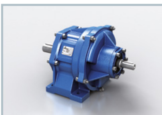
IHA With input shaft