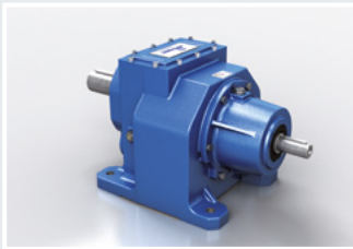
IH With input shaft