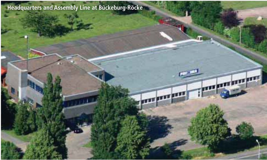
Headquarters and Assembly Line at Bückeberg-Röcke