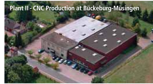
Plant II - CNC Production at Bückeberg-Müdingen