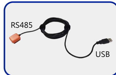
Smart Vibration Sensor x 2