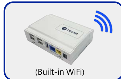
IoT Gateway x1