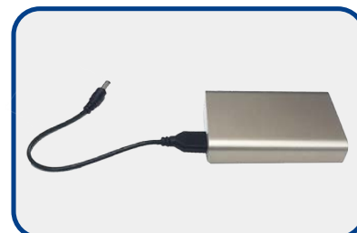
Mobile Power Pack x 1