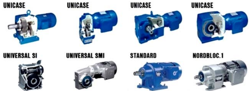
Range of Worm, Helical, Bevel Helical, Helical Worm, Parallel Shaft Reducers.

As early as the 1980s, NORD developed the most important innovation in gear unit construction to the present day. The unicast concept. All bearing holes and sealing surfaces are machined in a single stage on the latest CNC centres.