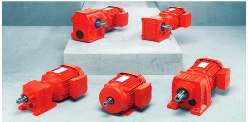
Range of Worm, Helical, Bevel Helical, Helical Worm, Parallel Shaft Reducers.

at the airport, or even you on escalators; everyone at SEW-EURODRIVE is moving and working everyday on creating the future of drive automation and making it a little better. This is how SEW-EURODRIVE has evolved throughout its history to become the market leader in the industry of drive automation with a turnover of more than EUR 2.5 billion.