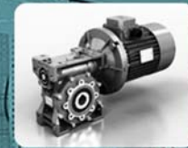
Gear Reducers / Gear Motors

POWER TRANSMISSION SOLUTIONS FOR VARIOUS INDUSTRIES