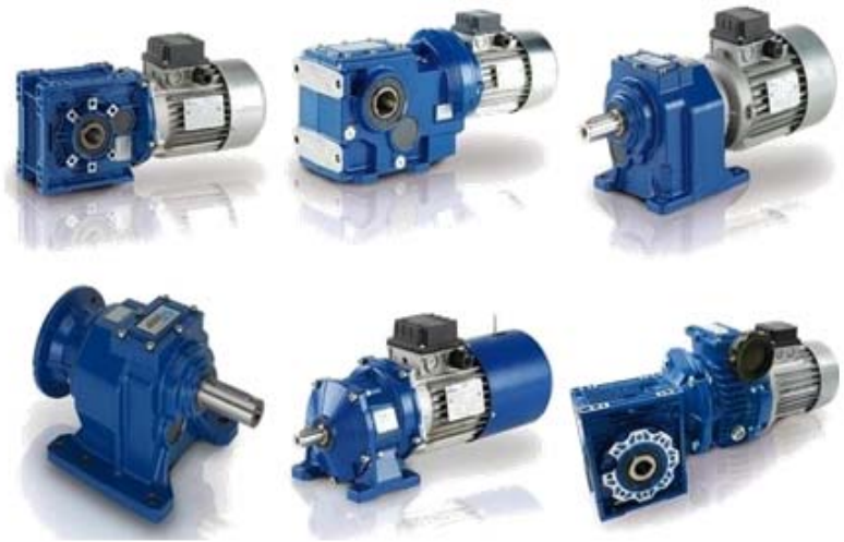
Range of Worm, Helical, Bevel Helical, Helical Worm, Parallel Shaft Reducers & Mechanical Speed Variators.

Motovario (ITALY) provides technologically advanced solutions in the transmission components field for industrial and civil applications worldwide. The Motovario corporate philosophy aims to promote the company's brand and products at an international level with determination and transparency, while constantly striving to offer innovative solutions for satisfying and anticipating the demands of the market.