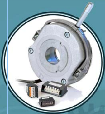
Safety Brakes & Rectifiers