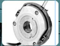
Safety Brakes & Rectifiers