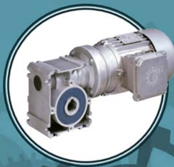
Gear Reducers Gear Motors